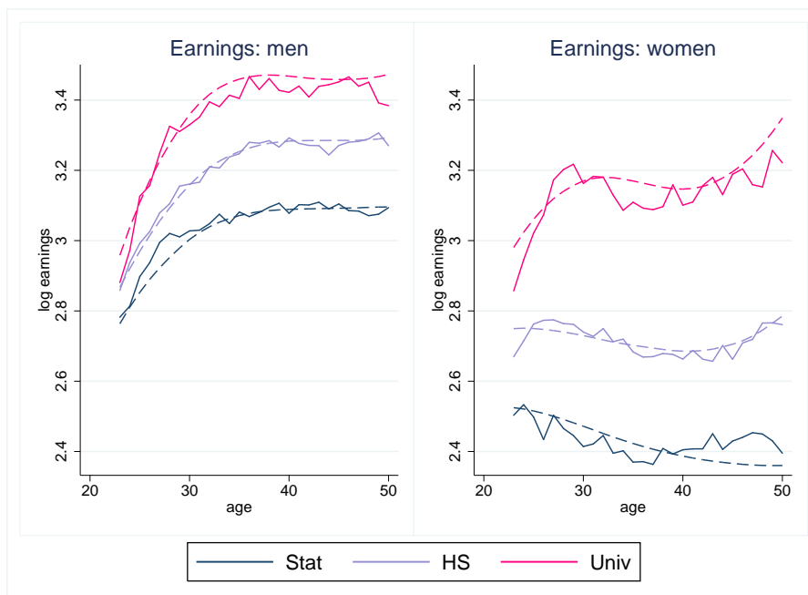
Figure 2: BHPS data and model predictions: log annual earnings for men and women over the lifecycle

Notes: Full lines are for BHPS data and the dashed lines are for model simulations. Annual earnings in real terms (£1,000, 2008 prices).