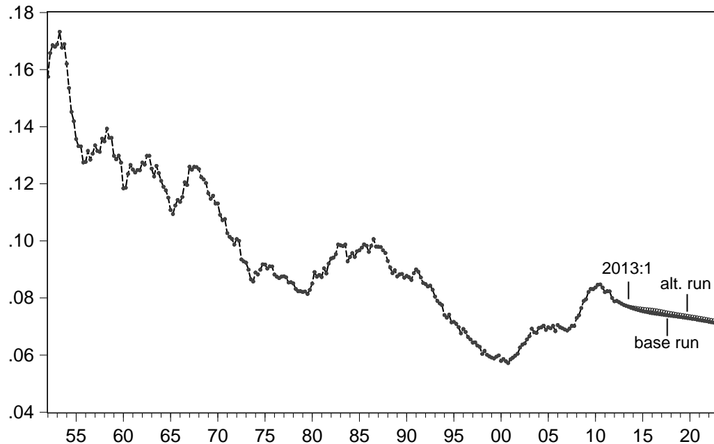
Figure 1 Federal Purchases of Goods and Services as a Percent of GDP: 1952:1--2022:4

Figures 1 and 2 give some perspective on the present results. Figure 1 plots the ratio of federal purchases of good and services to GDP for the 1952:1–2022:4 period. Values beyond 2012:1 are predicted values. Values for 2013:1 on are presented for both the base run and the alternative run. 8 The values for the prediction period are low by historical standards. As discussed in Section 3, no major changes in government purchases of goods and services were made for the prediction, and so the ratio is roughly flat.